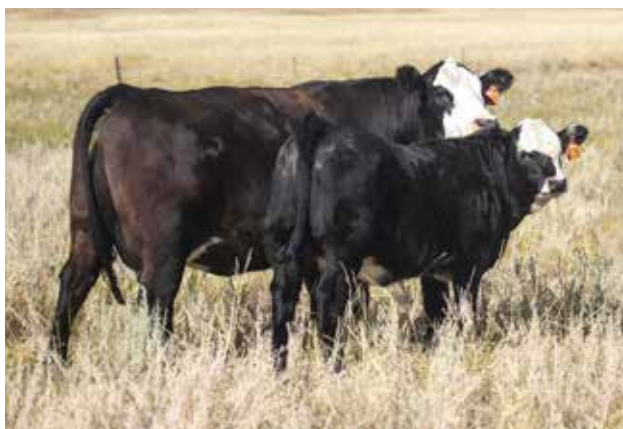
Our picture cow, #574, is pictured at 9 years old. She was sold by Cullen Ranch as a bred heifer in 2017

Same high quality blacks as Lots 17 & 18, only sorted by breeding dates. Bred to calving ease WEBO Angus bulls a K2 Union son.