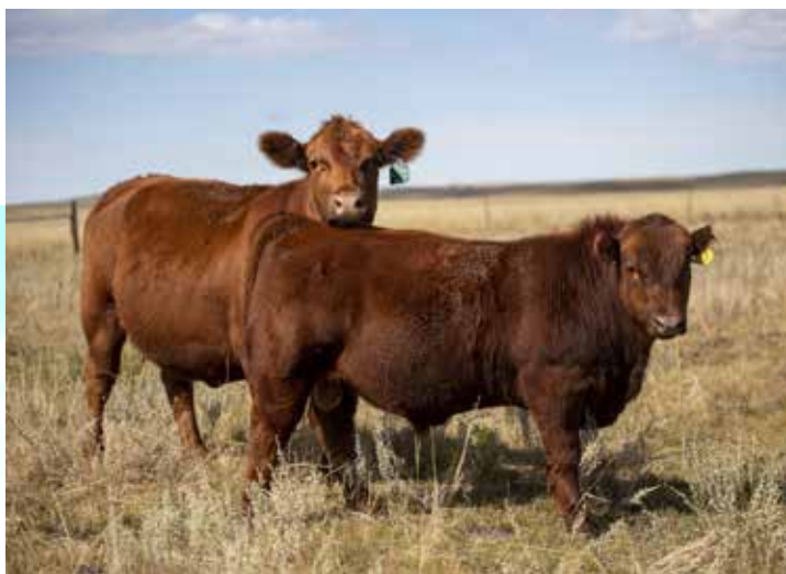
K2 Patriot 1073 3101 with dam summer 2023