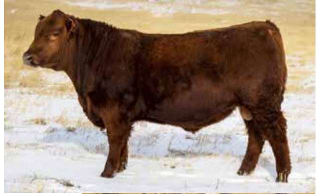
K2 Patriot 1073 3101

K2 Patriot 1073 3101 K2 Union 618 3136 K2 Lance 30H 43K K2 Lucas 05 266